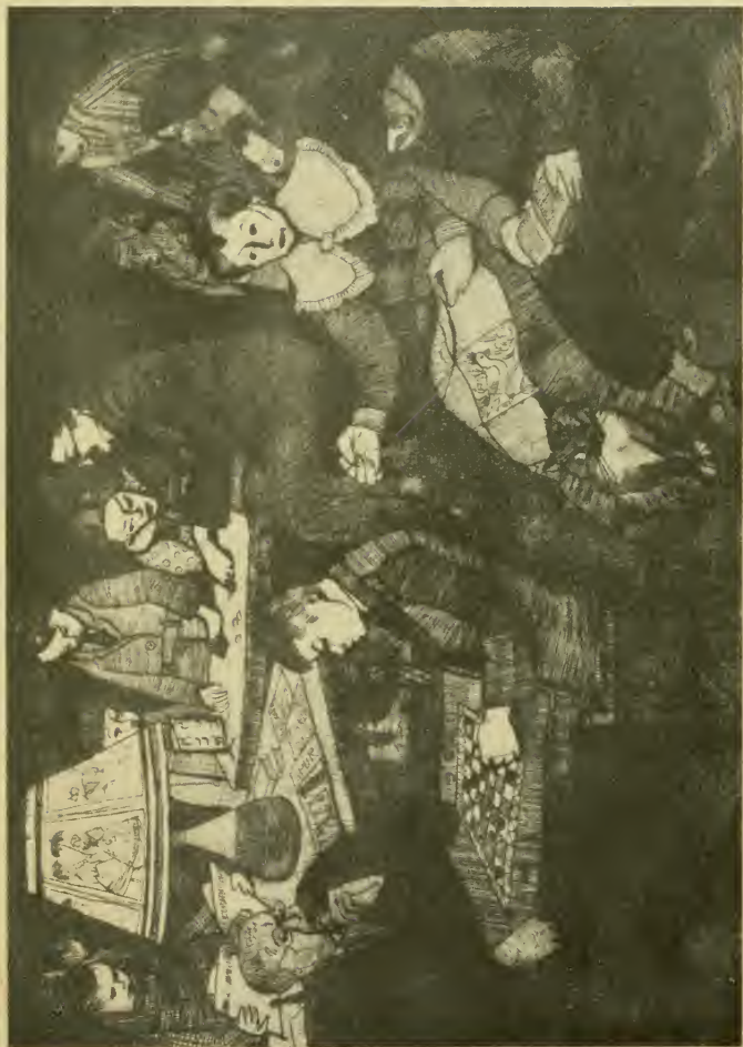
“A LARGE HOUSE FULL OF PARENTS, NURSES AND CHILDREN”